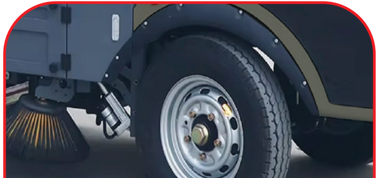
Durable Rubber Tyres