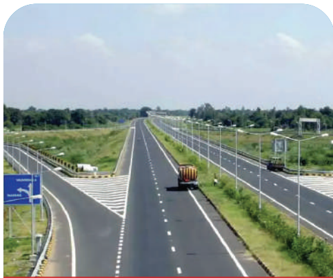
Roads & Highways

The DTMS-3000 EV battery-operated sweeper is designed for heavy-duty cleaning in various public and industrial spaces. It ensures efficient dust and debris removal, making it ideal for: