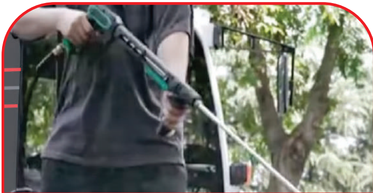
High Pressure Water Gun

From precision brushing to high-power vacuuming – every detail of DTMS-3000 EV is built for next-level street cleaning.